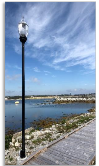
North East Point Boardwalk, District of Barrington