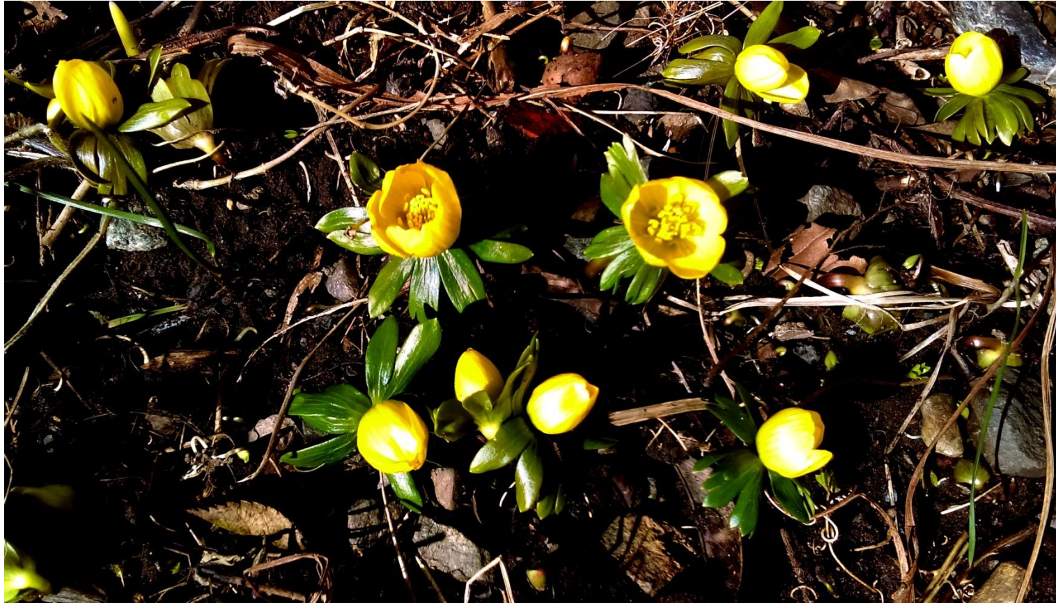
Winter Aconite, (Eranthis hyemalis) Yarmouth, N.S. February 15, 2018